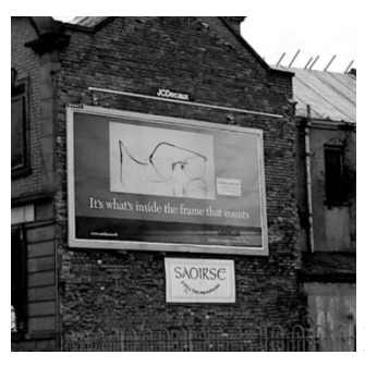
Figure 8: A mural with the slogan 'Saoirse—Free the Prisoners'. xxi

by learning about the conflict that one can hope to be a part of its solution. If the painted murals have told one story, the erased murals another, a new story is waiting to be told as part of its interface. (Figure 8)