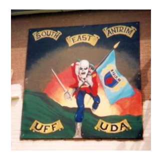
Figure 3: A mural of Iron Maiden's 'Eddie' figure carrying UDA flag and sword, which has been painted over, though similar ones continue to exist.xiv

For the conflation of violence and religious persecution is regaining a new foothold in the modern world, and the rhetoric of martyrdom helps us to understand its resurgence. The menacing trooper wielding a gun still exists but less as a hero of religious fervour and apostolic suffering, and more as the bandwagon of pop counter-culture. It underlines that an internalisation of the revolutionary and violent incarnations of martyrdom has taken place in a culture which has foregone the martyr's ability of sacrificial economy and has given in to a propagandist branding of self-annihilation. Maybe that is why the skull in the trooper mural is still the predominant trace (Figure 3).