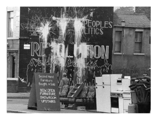
Figure 5: A paint-bombed mural<sup>xvii</sup>

Paint-bombing by rival groups have defaced numerous murals. However this instance of conflicting memories has a greater nuance in Northern Ireland. A walled installation of splashed surface inscribes the fate of any revolution today. The dripping paint against the remnant of emblems of struggle creates new contours. Against the larger history of the Easter Rising which failed to bring about complete independence, the non-freedom of half of Ireland resounds till date. Hence the dripping downward curves have to be regenerated with its distinct dimensional beauty (Figure 5).