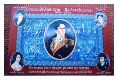
Figure 1: A mural with four panels painted to celebrate the bicentenary of Robert Emmet at Flax Street, Ardoyne, Belfast.<sup>vii</sup>

CAIN<sup>vi</sup> lists two murals of the martyr Robert Emmet – still existing and painted over. A portrait of Robert Emmet Commemoration has been painted over and the other with Emmet justifying the unsuccessful rebellion in court remains, along with the epigraph: "Let no man write my epitaph until my country takes her place among the nations of the world" (Figure 1).