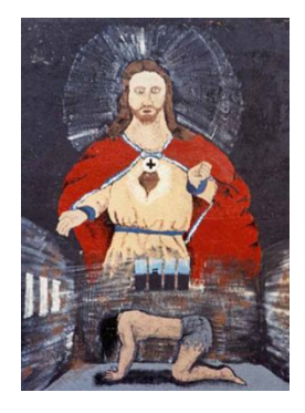
Figure 2: A mural at Beechmount Avenue, Falls, Belfast, 1981 depicting apostolic suffering.<sup>ix</sup>

is still macabre that one of the skulls on this paramilitary mural is surfacing again'viii. Murals dedicated to the IRA hunger strike martyrs like Bobby Sands tell a story of apostolic sacrifice and suffering (Figure 2),