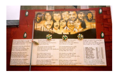
Figure 6: The mural containing the poem by poet and revolutionary, Bobby Sands. **xviii

Political struggle has forged its path through the means of language, and it's de-recognition is to club all protests as mere anti-establishment defiance. The language of the paint and the literature in the painting makes martyrdom a potent tool of representation. Given broad claims of solidarity such singular claims to literary, scripted memory is marked with solitude and erasure.